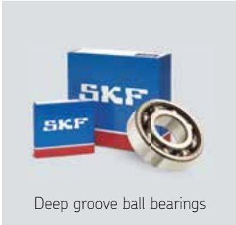
Deep groove ball bearings