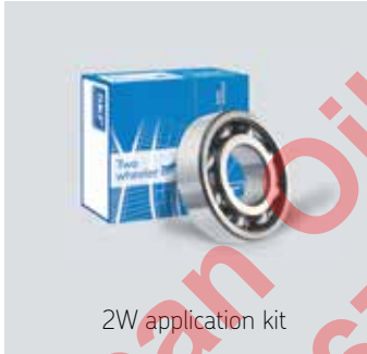
2W application kit