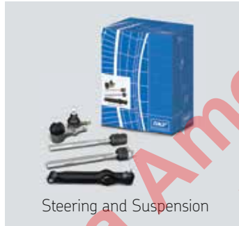
Steering and Suspension