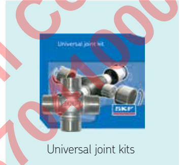
Universal joint kits