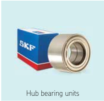
Hub bearing units