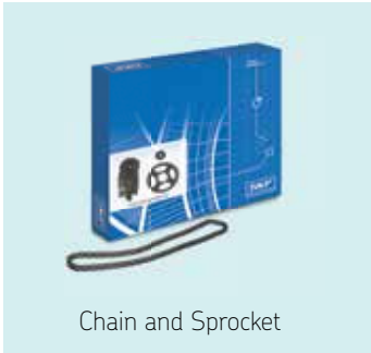
Chain and Sprocket