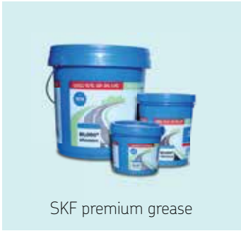
SKF premium grease