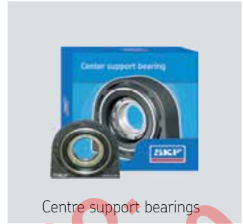
Centre support bearings